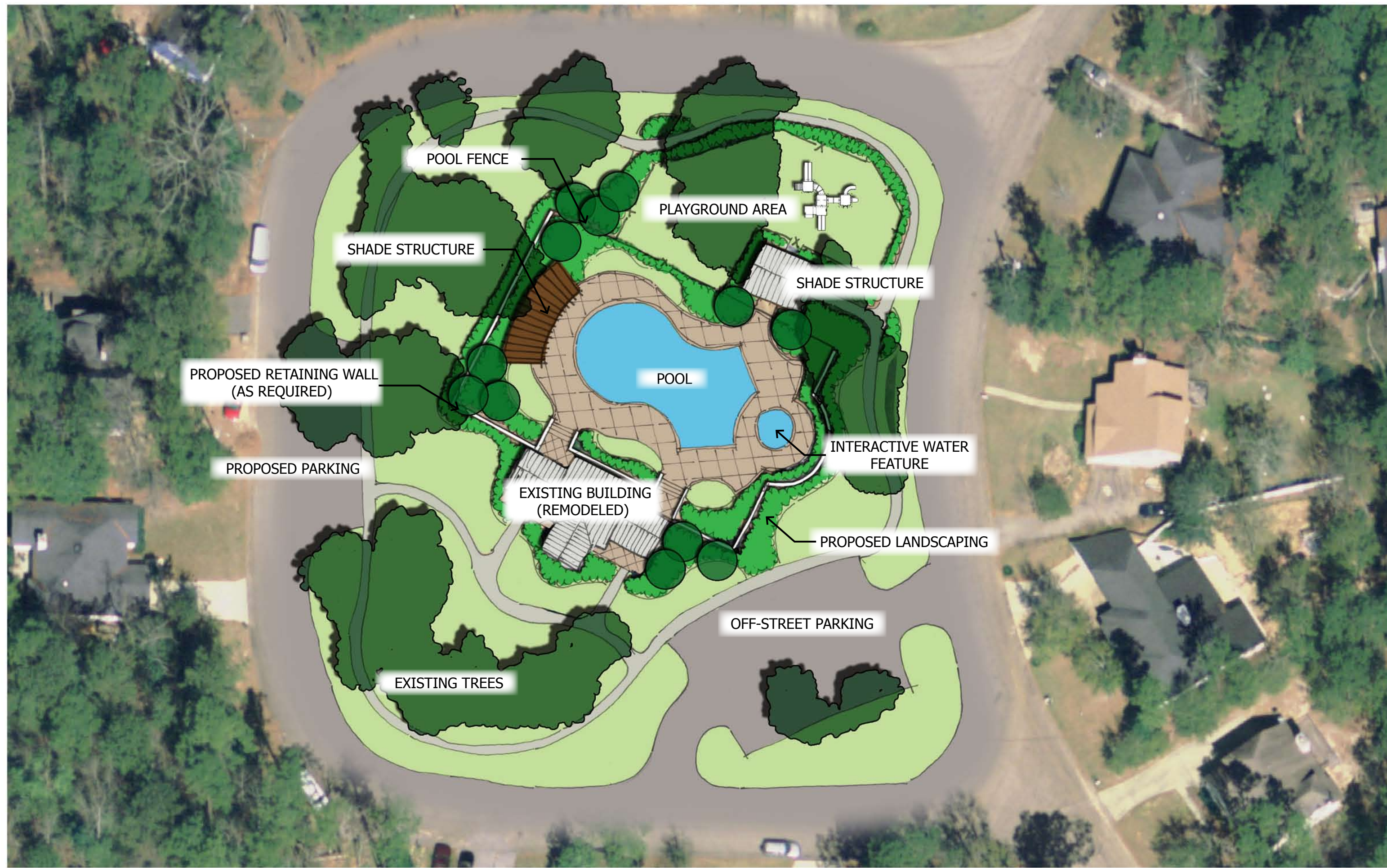
MONTCLAIR OPTION 1 scale: 1" = 30'