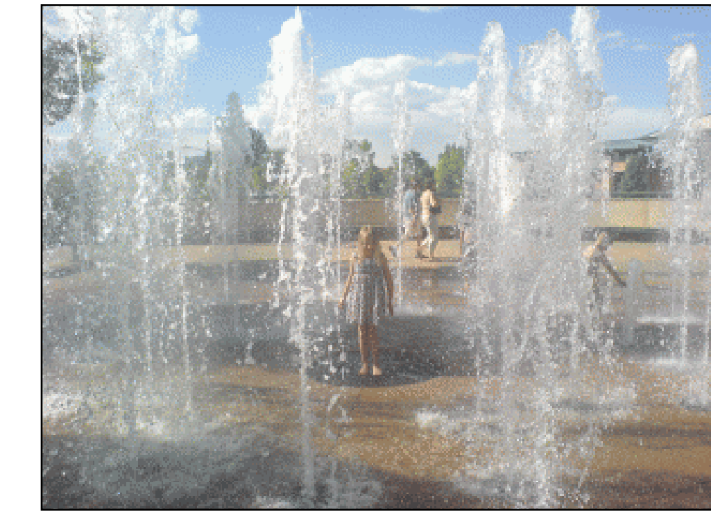
RIDGEWOOD CONCEPTUAL AMENITY AREA IMPROVEMENTS