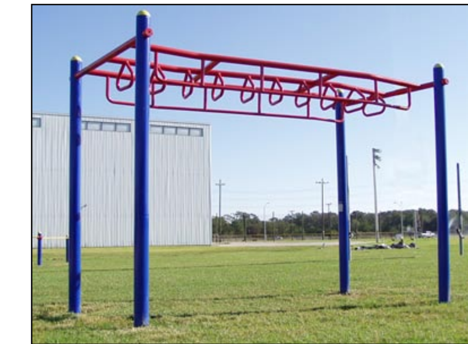
MONTCLAIR CONCEPTUAL AMENITY AREA IMPROVEMENTS