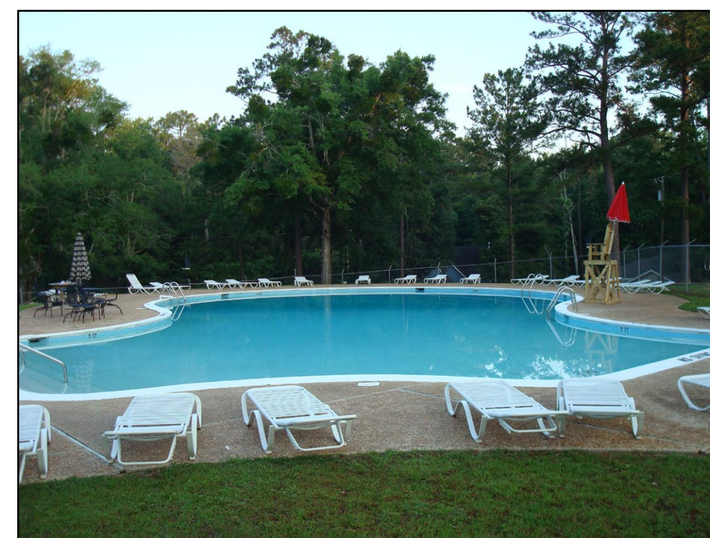
MONTCLAIR EXISTING CONDITION PHOTOS