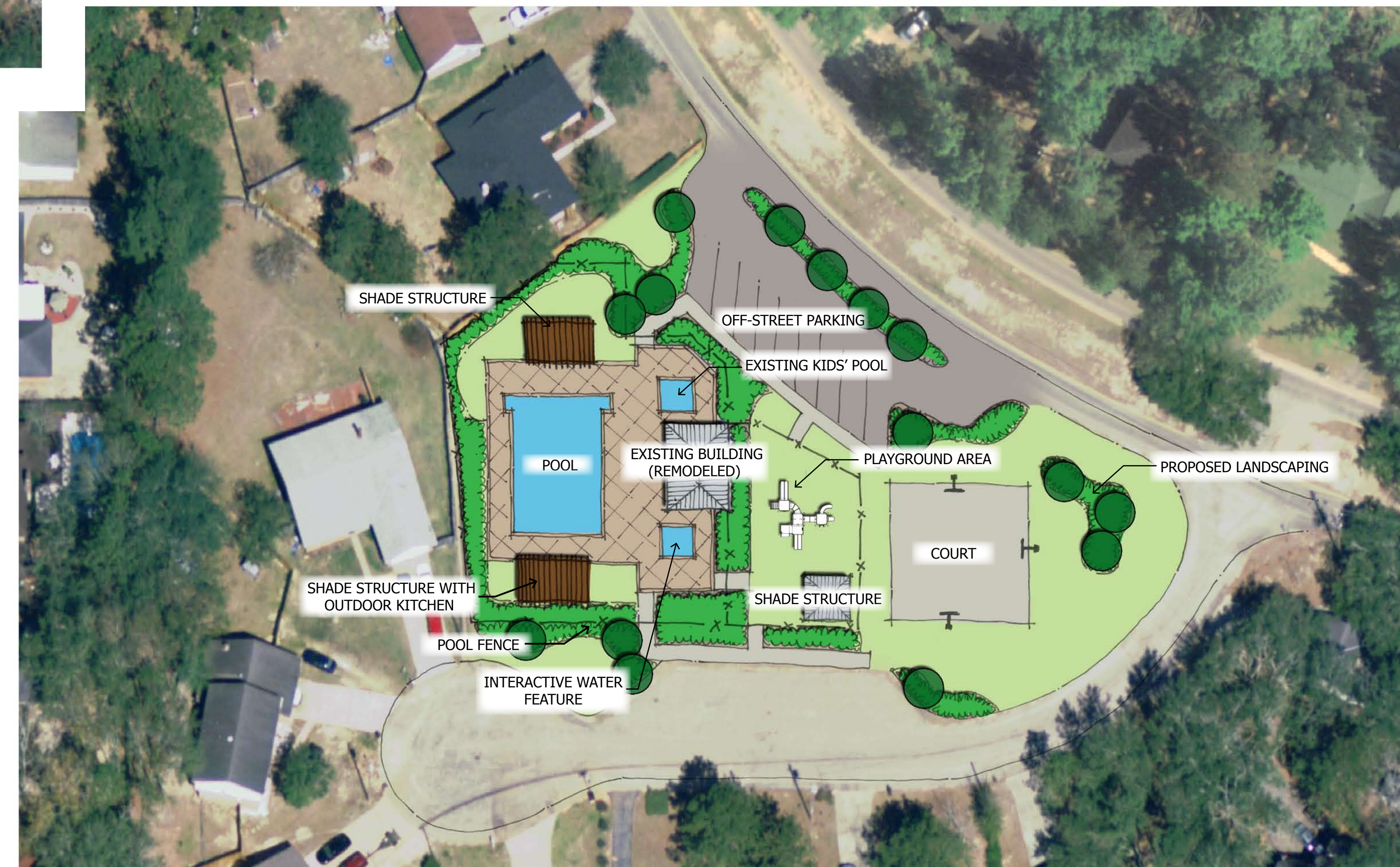
RIDGEWOOD OPTION 2 scale: 1" = 30'