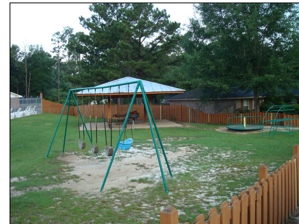
RIDGEWOOD EXISTING CONDITION PHOTOS